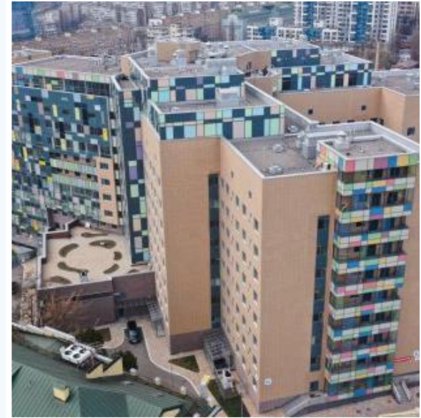
2022 Okhmatdyt The largest children's hospital in Ukraine