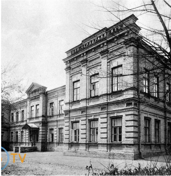
1894 Founding of the hospital